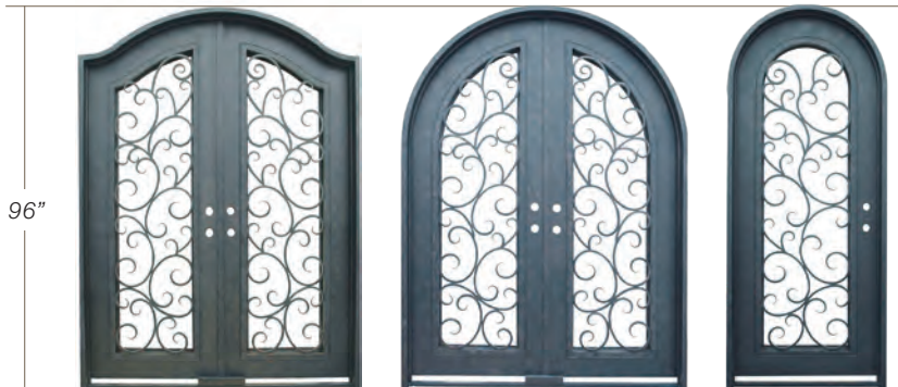
Eyebrow 64" Wide: 7048-64 72" Wide: 7048-72