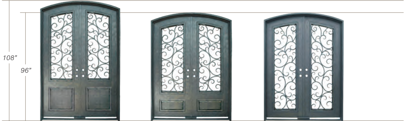
9'0 Segment 3/4 Lite 72" Wide: 8848-72108