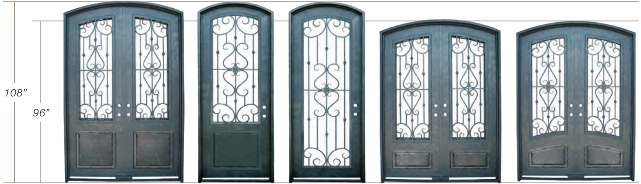
9'0 Segment 3/4 Lite 72" Wide: 8847-72108