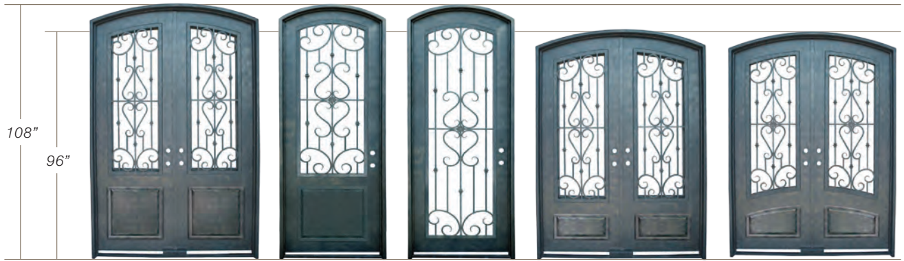
9'0 Segment 3/4 Lite 72" Wide: 8847-72108