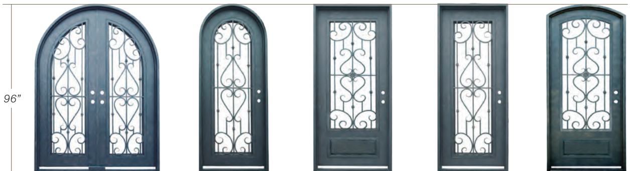
Radius 64" Wide: 6047-64 72" Wide: 6047-72