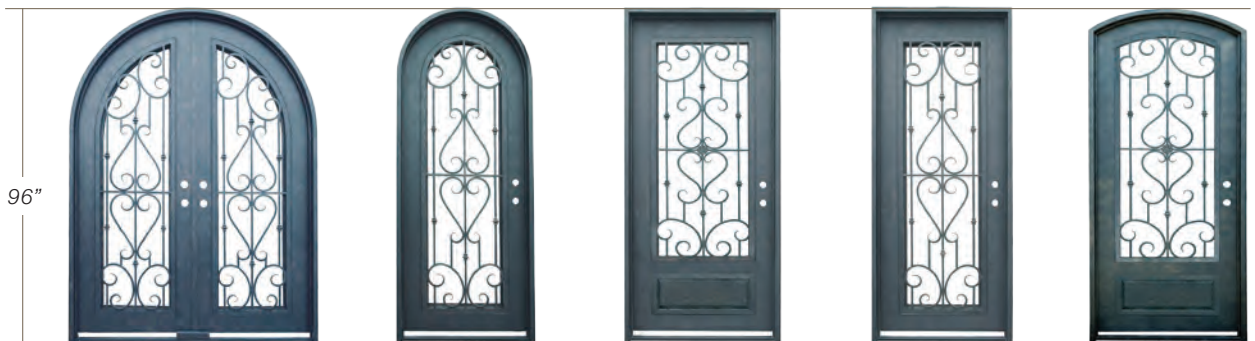
Radius 64" Wide: 6047-64 72" Wide: 6047-72