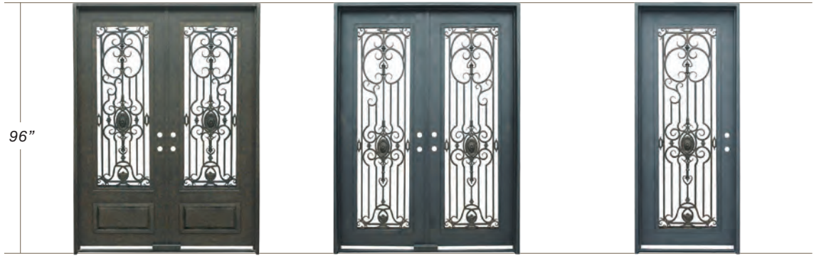
Segment 64" Wide: 8045-64 72" Wide: 8045-72