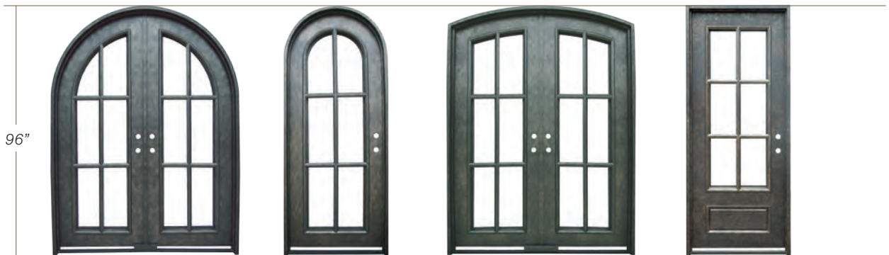
Radius 64" Wide: 6052-64 72" Wide: 6052-72