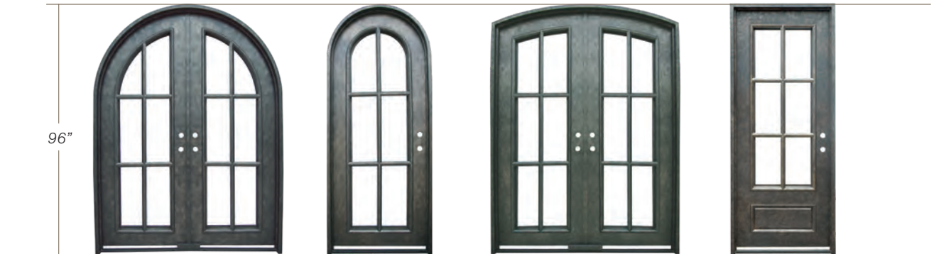
Standard (sgl) 39-1/2" Wide: 1052