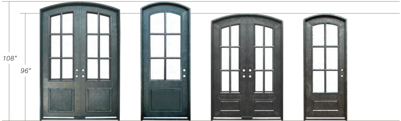
9'0 Segment 3/4 Lite 72" Wide: 8852-72108