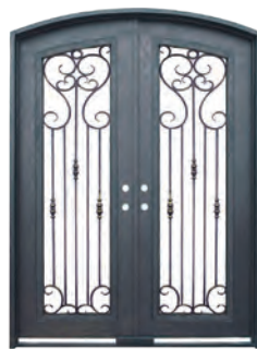
Standard 8'0 Double