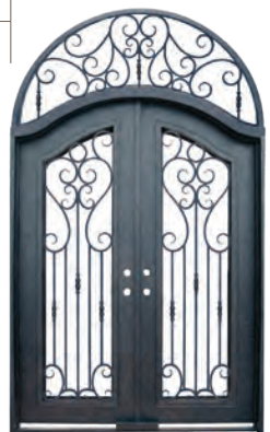
Segment 3/4 Lite 9'0 Double