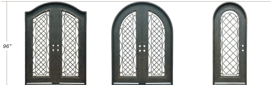
Eyebrow 64" Wide: 7050-64 72" Wide: 7050-72