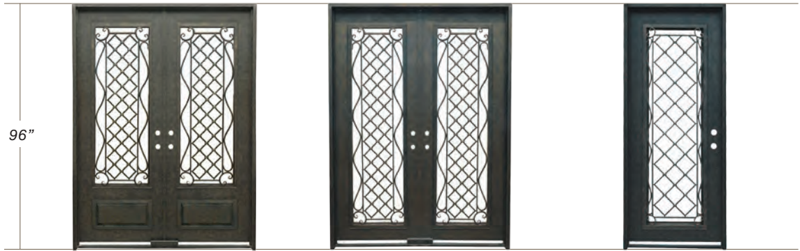
Standard 3/4 Lite 64" Wide: 4850-64 72" Wide: 4850-72