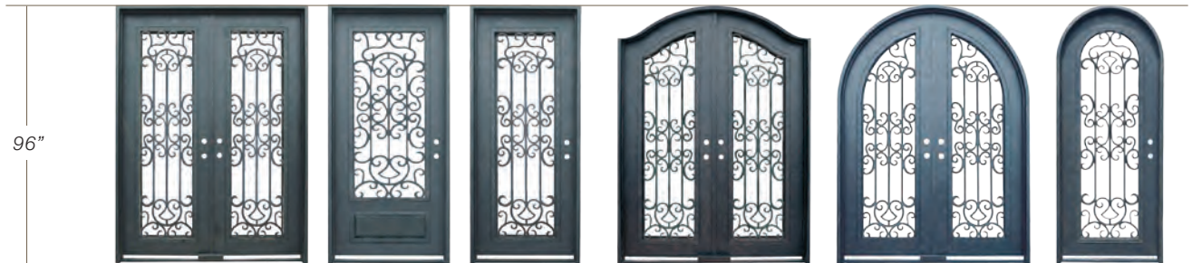
Segment 3/4 Lite (sgl) 44" Wide: 3853-44