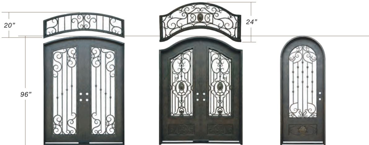
Segment (72" x 96") & Segment Transom (72" x 20") (note - unit height with transom: 112")