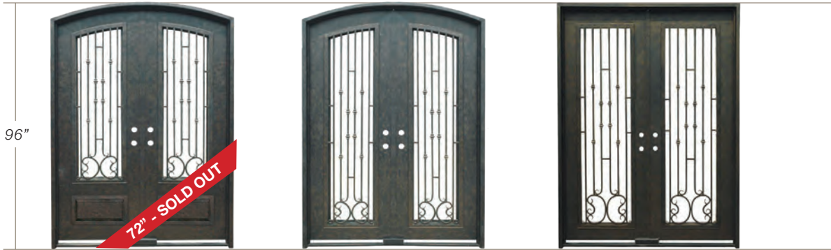
Segment 3/4 Lite

4300 Concorde Rd. • Memphis, TN 38118 Phone: (800) 748-1510 • Fax: (901) 547-1148