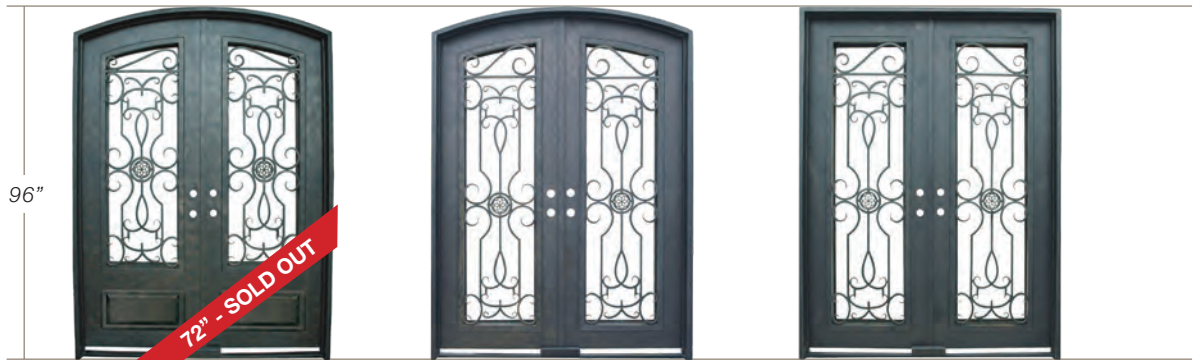
Segment 3/4 Lite

4300 Concorde Rd. • Memphis, TN 38118 Phone: (800) 748-1510 • Fax: (901) 547-1148